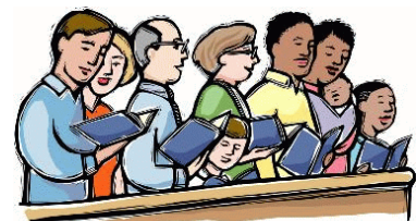
New Roman Missal

This session will be offered in the parish hall on Saturday, January 29, 2011 . The day begins at 9:30 a.m. and concludes at 2:30 p.m. Lunch is included. All parishioners and friends are welcome!